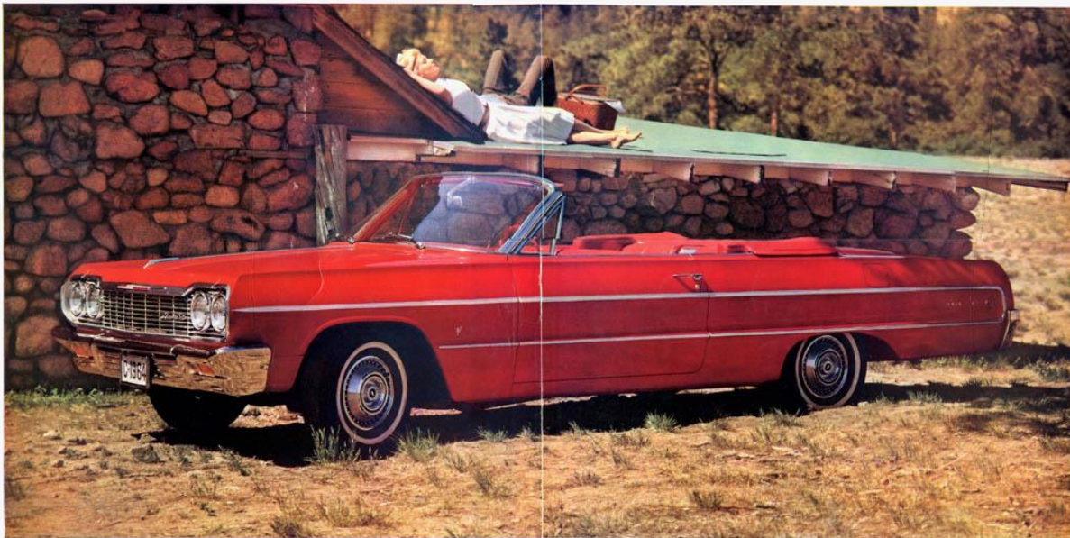
Chevrolet Impala Convertible—all smooth way to your GM's Future at the New York World's Fair